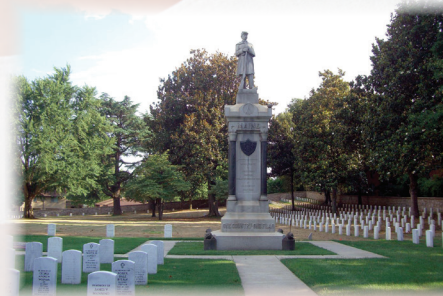
Salisbury National Cemetery

Our professional staff will arrange Military Honors for a dignified military service to be held at the Salisbury National Cemetery. Special veterans urns, with the appropriate military insignia, may be used for these ceremonies. At that time, family and friends have an opportunity to gather to give a final salute to our fallen heroes.